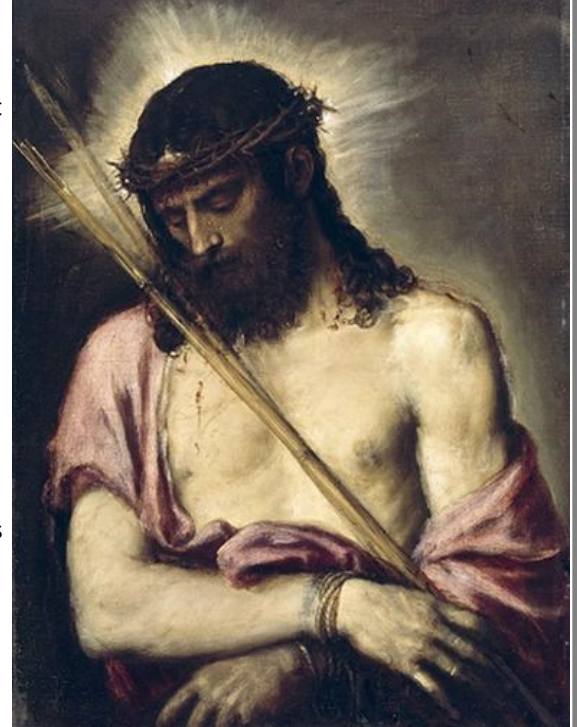
Ecce Homo by Titian

During the early twentieth century, in Mexico, Russia, and some parts of Europe, militantly secularistic regimes threatened not just the Catholic Church and its faithful but civilization itself. Pope Pius XI's encyclical gave Catholics hope and—while governments around them crumbled—the assurance that Christ the King shall reign forever. Jesus Christ "is very truth, and it is from him that truth must be obediently received by all mankind" ( Quas primas , ¶17).