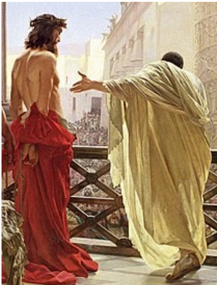
Ecce Homo by Antonio Ciseri

Parish email: sgdate@charlottediocese.org Website: www.immaculateconceptionforestcity.org