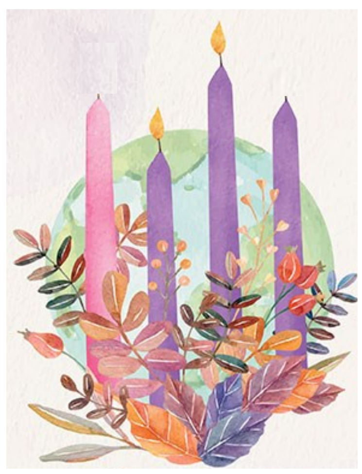
Prepare the way of the Lord, make straight his paths

Parish email: sgdate@charlottediocese.org Website: www.immaculateconceptionforestcity.org